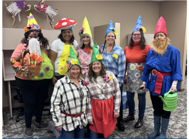
Halloween Costume Contest