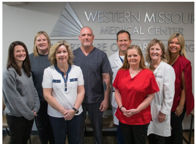
WMMC Recognition Relay