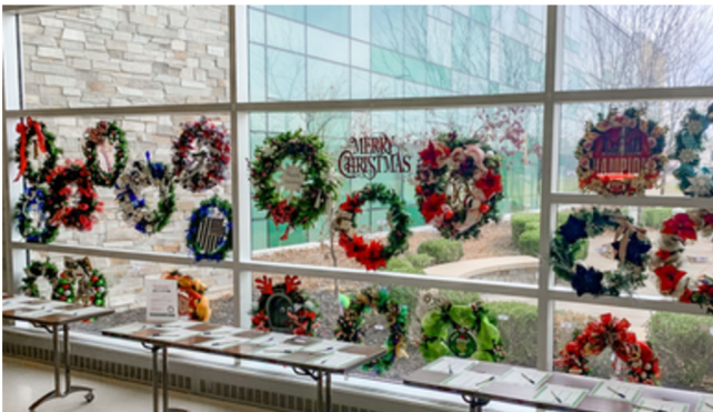
Christmas Wreath Contest