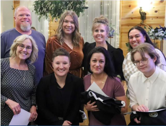
Annual Awards & Recognition Ceremony