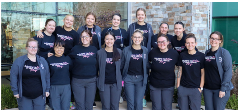
LPN Career Pathway Students

This initiative opens doors for local students interested in healthcare and helps build a strong workforce to serve our community.