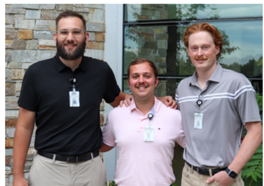
ATSU Medical Students