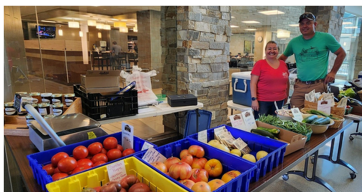
Bringing the Benefits to You Vendor