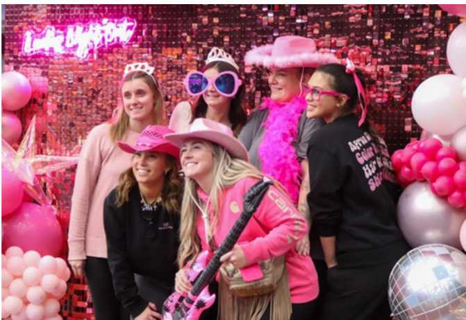
Ladies' Night Out