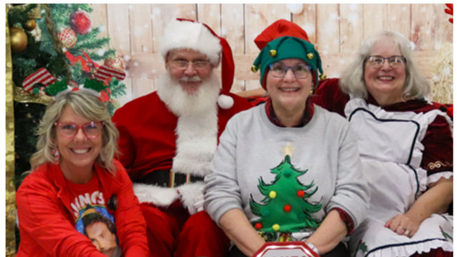
Visit from Santa & Mrs. Claus