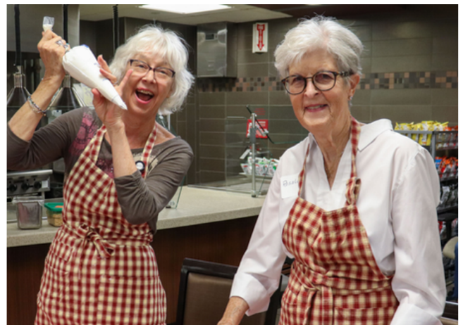
Auxiliary Ice Cream Social