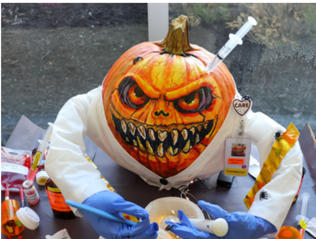
Pumpkin Decorating Contest