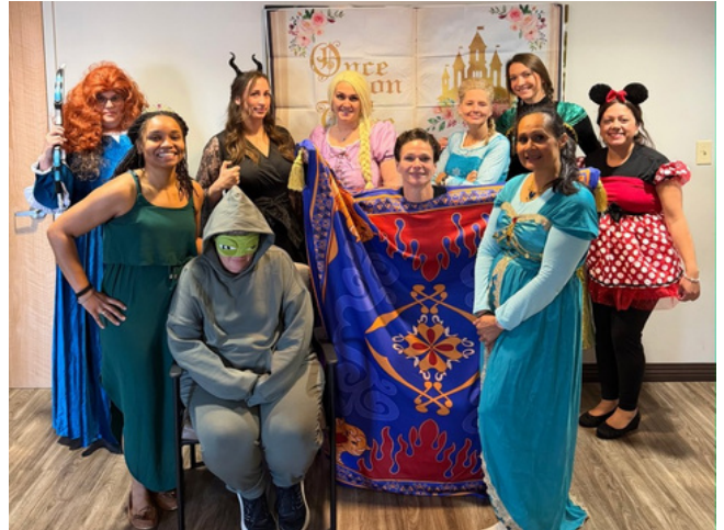
Halloween Costume Contest