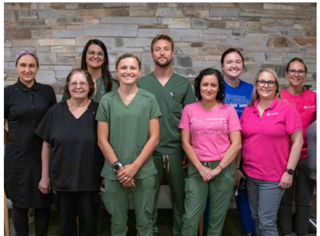
WMMC Recognition Relay