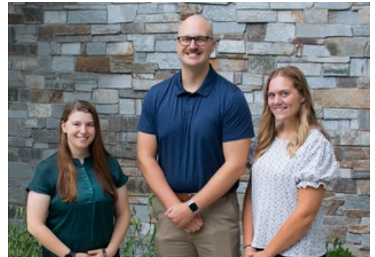
ATSU Medical Students