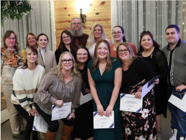
Annual Awards & Recognition Ceremony