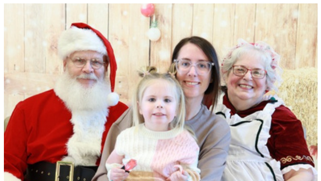
Visit from Santa & Mrs. Claus