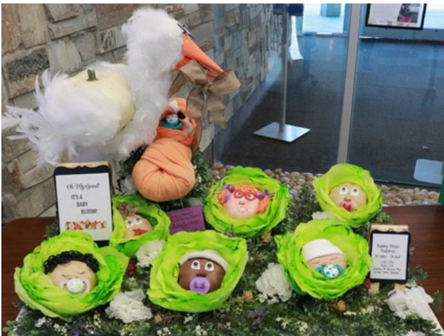
Pumpkin Decorating Contest