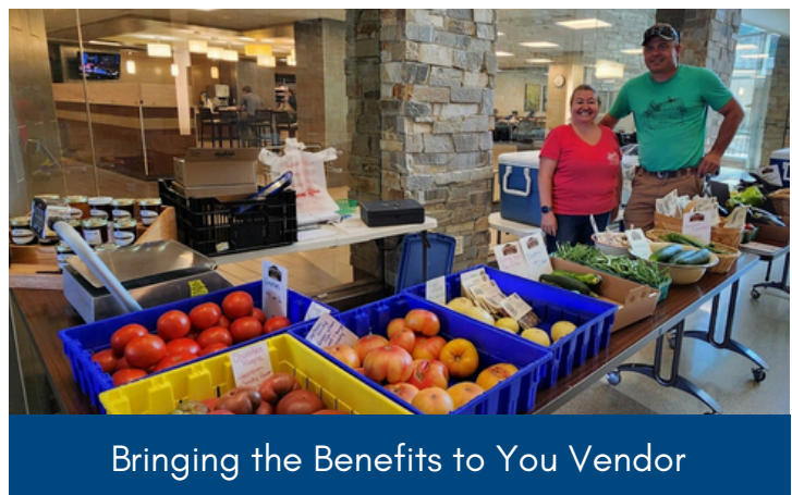
Bringing the Benefits to You Vendor